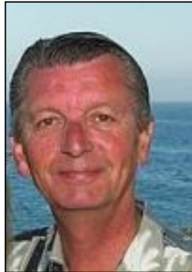
Wes Nelson Green Waste Carpet Recycling